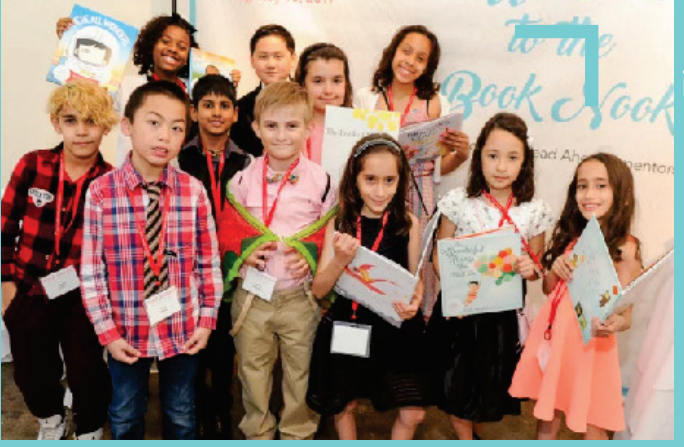
LATHAM & WATKINS STUDENTS FROM P.S. 116

The Read Ahead gala draws 300+ attendees that include CEOs, partners and senior representatives of leading New York City businesses. The 2018 event will be held at the breathtaking Tribeca Rooftop and includes special guest appearances, a three-course dinner and awe-inspiring reflections from Read Ahead students.